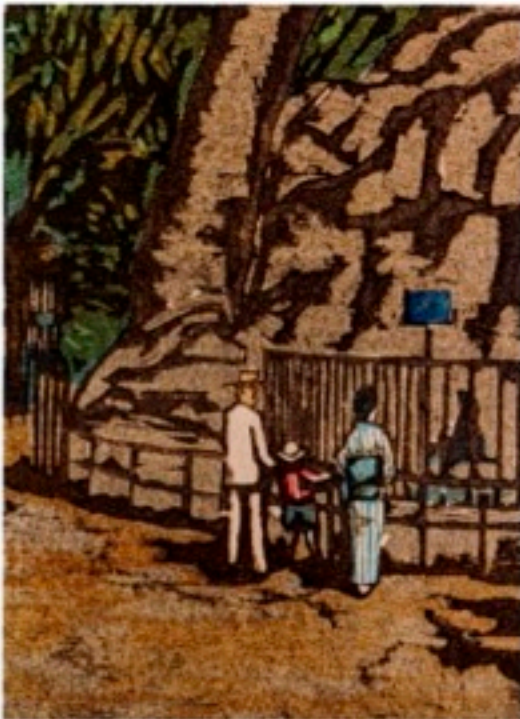
Onchi Koshino, Ueno Zoo (Detail), 1945, woodblock print, 7.13 in x 9.5 in, The Trout Gallery, 2018.3.23

TOP SECRET (FOR AGES 5-8) • BEGINS AT BOSLER LIBRARY AND ENDS AT THE TROUT GALLERY