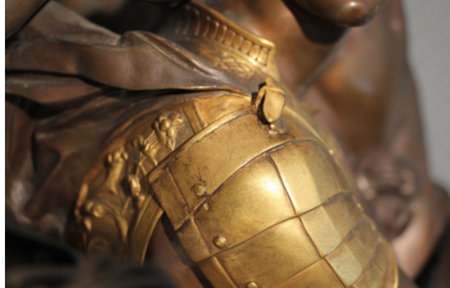
Gloria victis (detail) after conservation