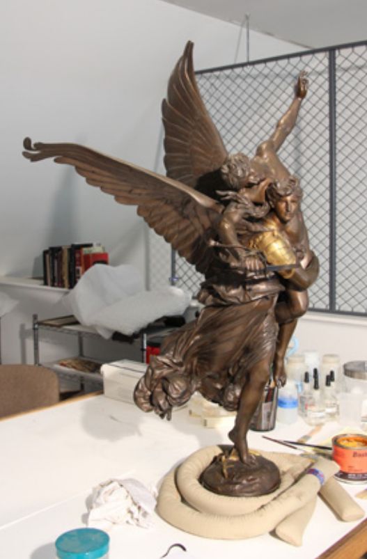
Gloria victis at the conservation studio