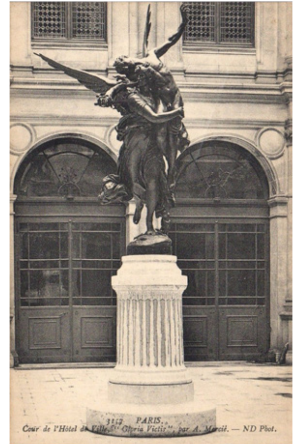
Marius-Jean-Antonin Mercié, Gloria victis , 1874. Cour de l'Hôtel de Ville, Paris.

A preliminary review of the bronze statue was conducted in order to identify the proper treatment plan. Small, non-invasive tests were performed in order to determine the stability and condition of the metal. This Gloria victis proved to be in stable condition with only inactive corrosion over the thin brown patina, determined by stereoscope analysis. The corrosion was situated in a spray pattern of spotty, raised, green, waxy residue sitting on top of the patina. The spray was observed along the back, wings, face, and arms of both figures. In other areas, the patina had been worn down due to cleaning or rubbing over time, as observed by the variation of color and sheen of the surface. The soldier's broken sword and the tip of the winged figure's proper right wing and feather on its proper left wing were identifiably bent, possibly due to a fall at some earlier date.