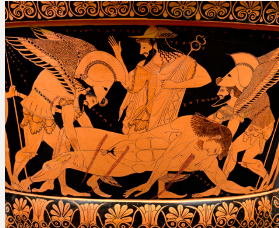
Euphronios, Sarpedon Lifted by Hypnos and Thanatos in the Presence of Hermes , red figure calyx-krater, 6th–5th century BCE. Museo Nazionale di Villa Giulia, Rome.

By representing Thanatos carrying a fallen warrior as the subject of Gloria victis , Mercié downplayed the issue of French defeat and bestowed honor on those who died in battle, regardless of the military outcome.