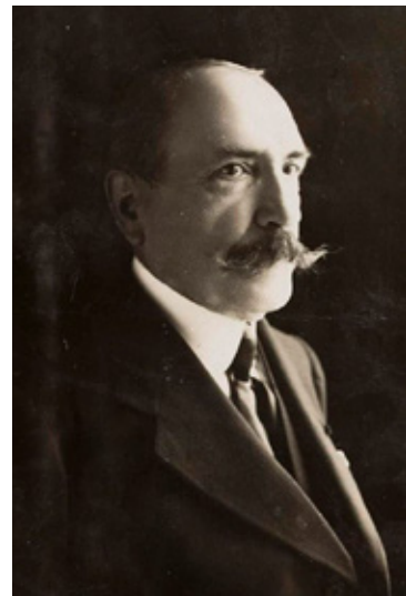
Marius-Jean-Antonin Mercié, c.1916.

Marius-Jean-Antonin Mercié (b. Toulouse, 1845–d. Paris, 1916) studied at the École des Beaux-Arts in Paris, with François Jouffroy and Alexandre Flaguère, where he mastered the classical vocabulary and academic training that was to provide the basis for his long and distinguished career. In 1868, he was awarded the Prix de Rome and completed his studies at the Academie de France. In Rome, Mercié received the Légion d'honneur and first-class medal for his David Victorious . He followed shortly thereafter with the Gloria victis of 1874. Both the David Victorious and the Gloria victis represent Mercié's skillful combination of Renaissance classicism and Baroque exuberance and technical complexity. Over the course of the next five decades, he became one of the most successful French sculptors of his age. Ultimately, he returned to the École des Beaux-Arts as professor and he was appointed president of the Société des Artistes Français.